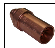
MCE — MEH