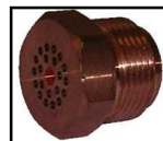
AV - AVM